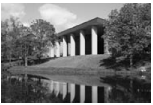
Many of the questions answered in this booklet will be treated in-depth in AiG's Creation Museum near Cincinnati.

The fascinating topic of Noah's Ark and the Flood are major themes of AiG's Creation Museum, to open in 2007 in Northern Kentucky (and near the Cincinnati Airport). Find out more at www.AnswersInGenesis.org