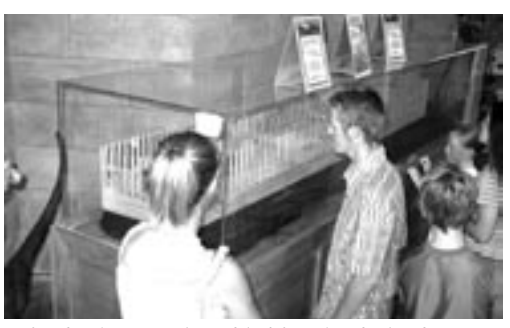
This "breakaway" scale-model of the Ark is displayed at AiG's future Creation Museum near Cincinnati, Ohio (open 2007).

The dimensions of the Ark are still impressive today, even when compared to many modern ocean-going ships: about 450 feet long, about