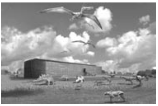
The size of the Ark makes sense only if the Flood were global.

In 2 Peter 3, the coming judgment by fire is